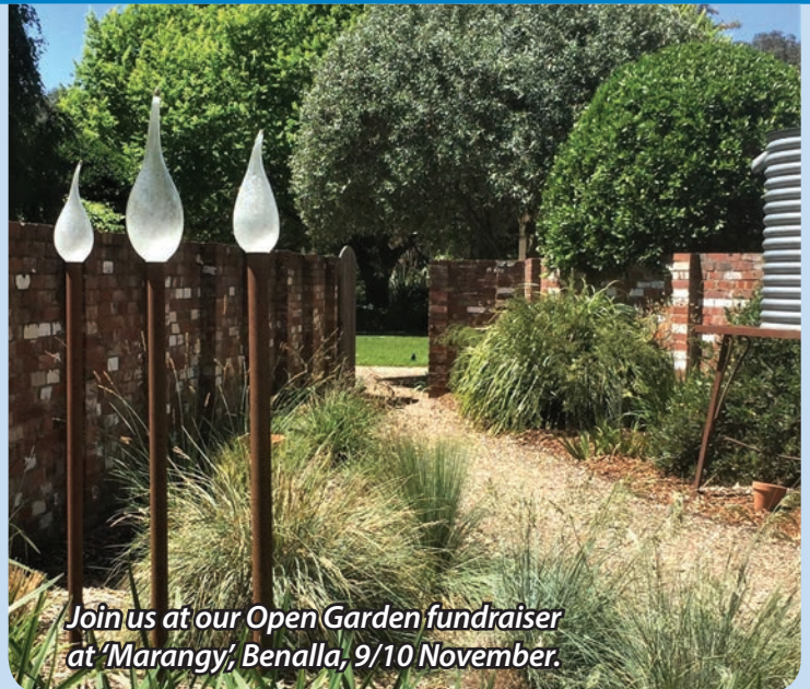
Join us at our Open Garden fundraiser at 'Marangy', Benalla, 9/10 November.

If you are interested in joining the Friends or are available to help at the event, please contact us on admin@tomorrowtoday.com.au or (03) 5762 1211.