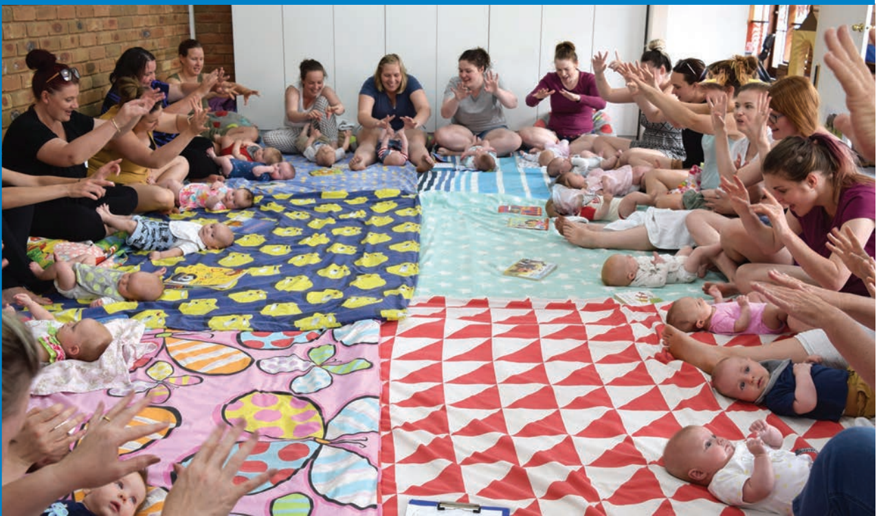
At PEEP 'song time' parents and babies build connections essential for a great start in life.