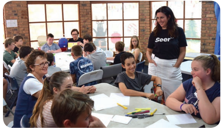
One of the digital workshops at Tomorrow Today.

If you have a job or volunteering vacancy or you are searching for work, why not log on to www.benallaworks.com.au and see if you can find your perfect match!