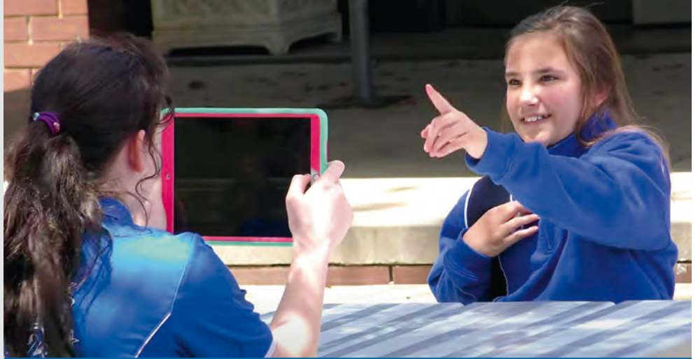
Students capturing footage for their digital stories.

School can be expensive. Purchasing new books, shoes, uniforms and stationery can be particularly stressful for families struggling financially. Thanks to the wonderful support of the Foundation for Rural and Regional Renewal (FRRR) and the generosity of local donors, Tomorrow Today distributed 390 Back to School vouchers worth $19,500 to eleven Benalla and district schools. School principals and welfare staff distribute the $50 Kmart, Target or school uniform shop vouchers to families experiencing financial hardship. 2021 is the seventeenth consecutive year that Tomorrow Today has worked with FRRR to assist local families with back to school expenses. In that time over $300,000 worth of vouchers have been given to local families. Our sincere appreciation to FRRR for their commitment to assisting rural communities like ours; and to the people locally who give so that extra vouchers can be secured.