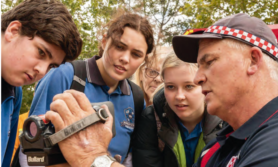
Students learning about digital tools used by the CFA.