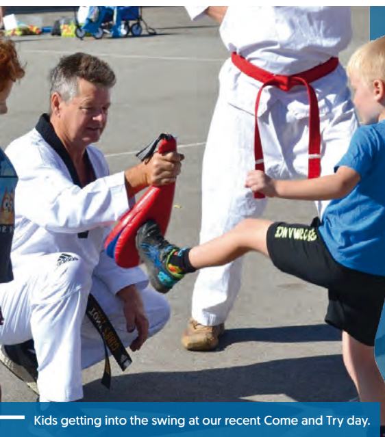
Kids getting into the swing at our recent Come and Try day.