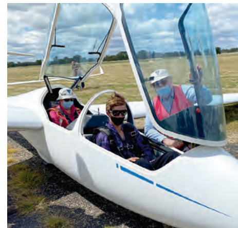
Ready to take flight.

Covid restrictions changed the way Connect9 was delivered in 2020. The young mentees and their community mentors showed terrific attitude and spirit, trying a range of virtual and face-to-face community experiences enthusiastically supported by the Benalla Art Gallery, Benalla Scout Group, GOTAFE, CSU, Galen College VEX Robotics team and the Gliding Club of Victoria.