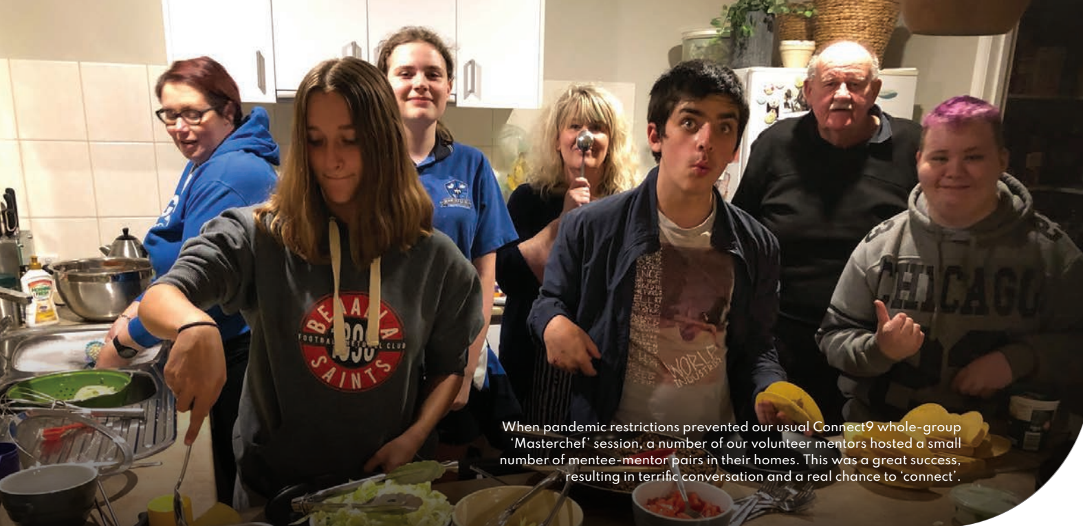
When pandemic restrictions prevented our usual Connect9 whole-group 'Masterchef' session, a number of our volunteer mentors hosted a small number of mentee-mentor pairs in their homes. This was a great success, resulting in terrific conversation and a real chance to 'connect'.