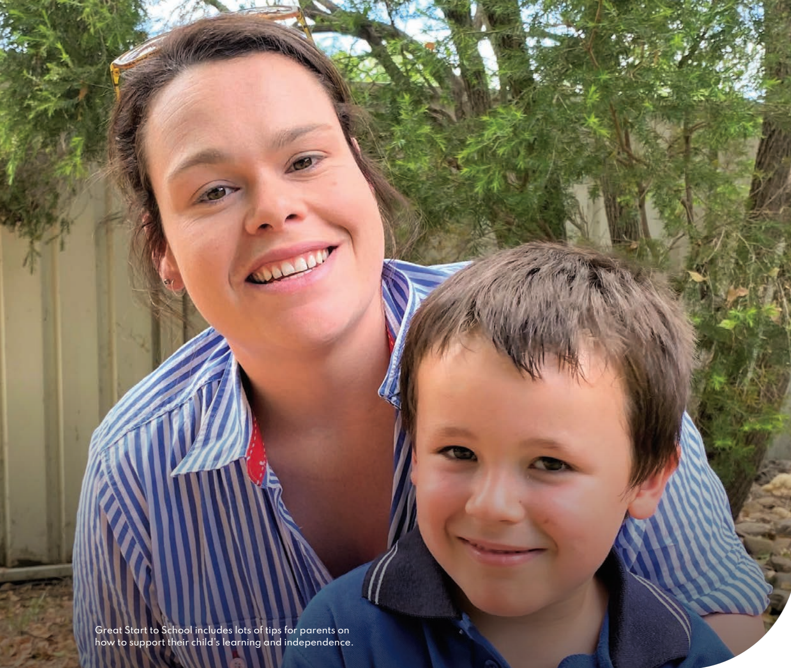
Great Start to School includes lots of tips for parents on how to support their child's learning and independence.