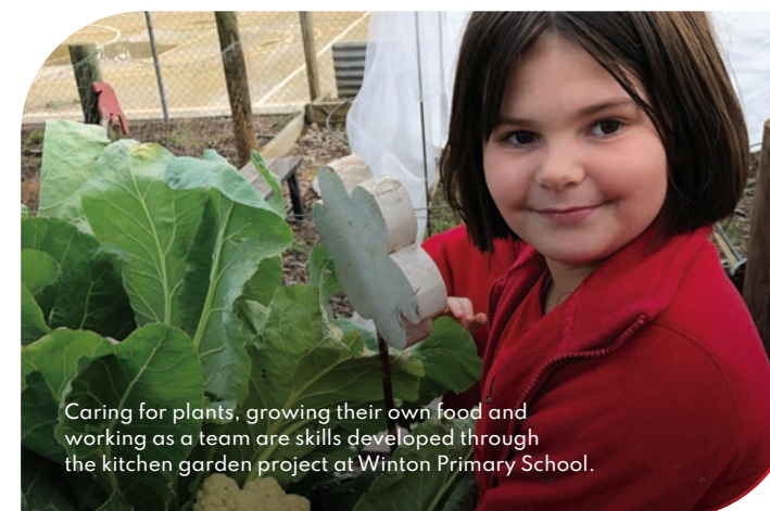
Caring for plants, growing their own food and working as a team are skills developed through the kitchen garden project at Winton Primary School.

We support a range of local projects each year (detailed on the following pages) funded by income from the Community Fund.