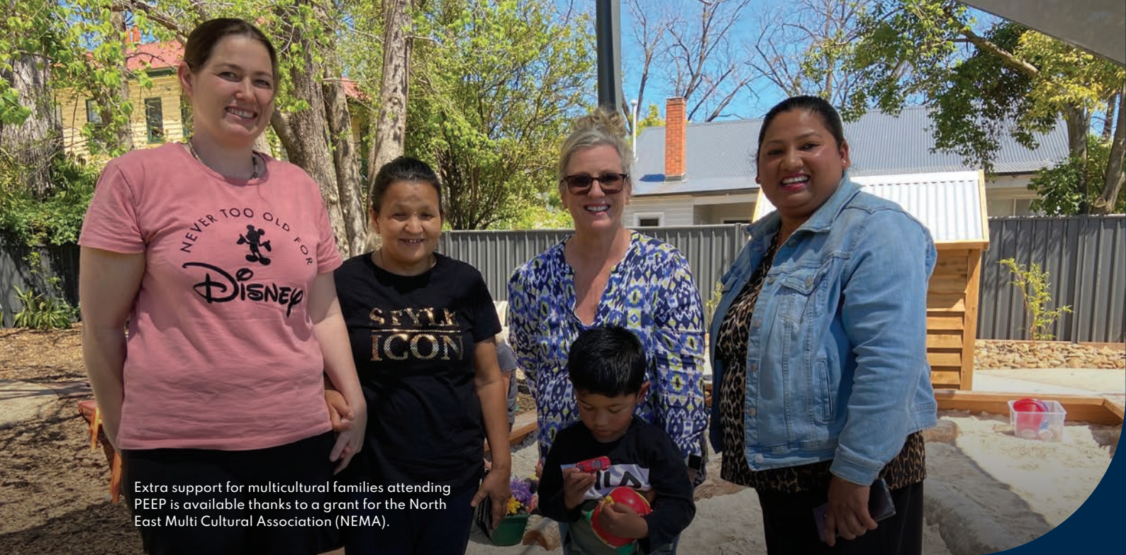
Extra support for multicultural families attending PEEP is available thanks to a grant for the North East Multi Cultural Association (NEMA).