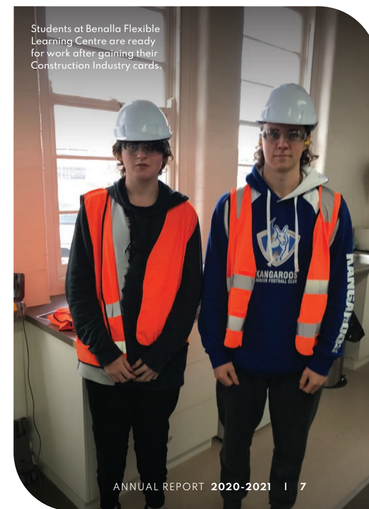
Students at Benalla Flexible Learning Centre are ready for work after gaining their Construction Industry cards.