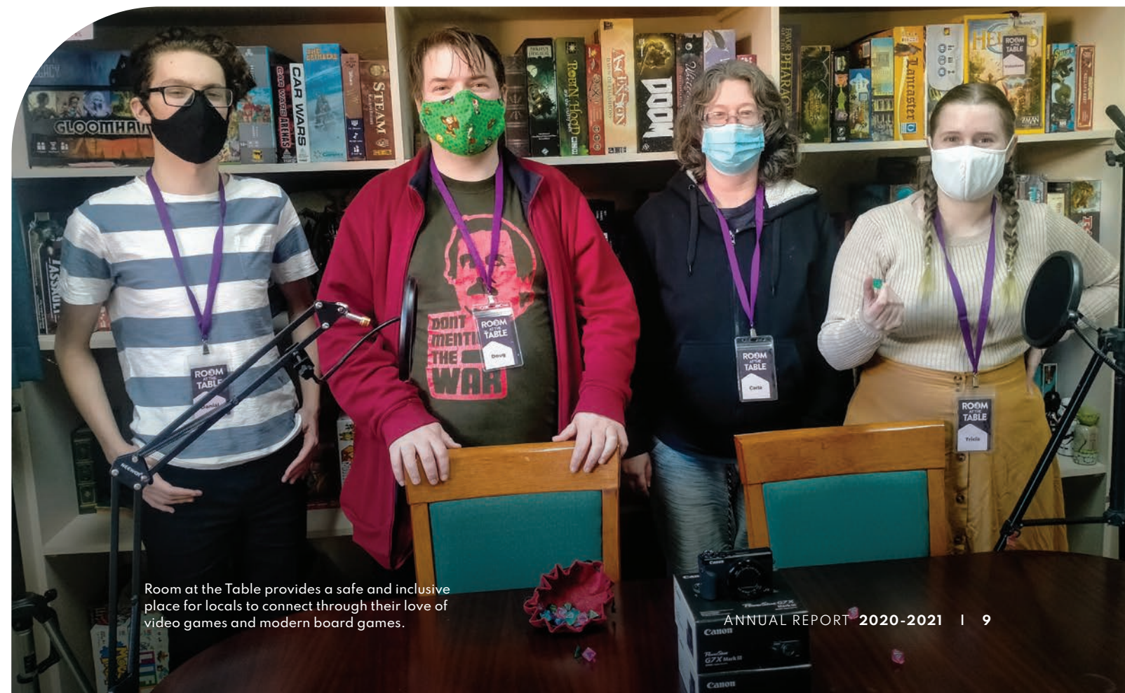
Room at the Table provides a safe and inclusive place for locals to connect through their love of video games and modern board games.

The Portsea Camp provides an opportunity for children to make new friends from other towns, develop a sense of worth in a caring and challenging environment, see life in a different way and develop an understanding of their place in the broader world. Our grant assisted 27 children in Years 5/6 to attend the camp in January 2021.