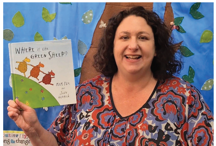
A video of Nonie reading one of our favourite books.

The PEEP team are now planning for a return to face-to-face programs in line with COVID-safe guidelines from Term 3 onwards.