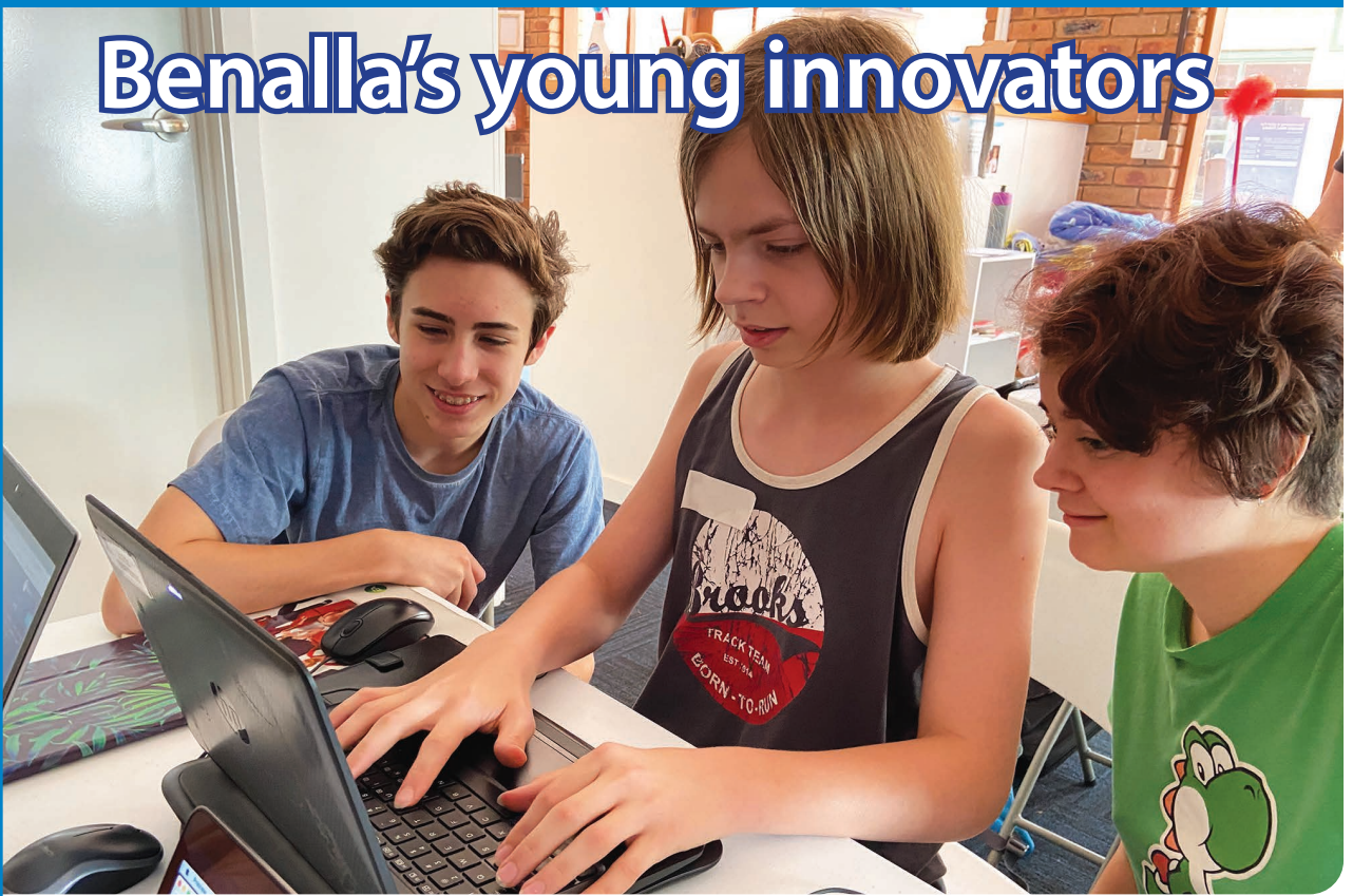
One of the teams working on coding for the new website.

Twenty-one of Benalla's young people took on a challenge earlier this year – to identify and solve a local issue, using creativity, teamwork and technology.