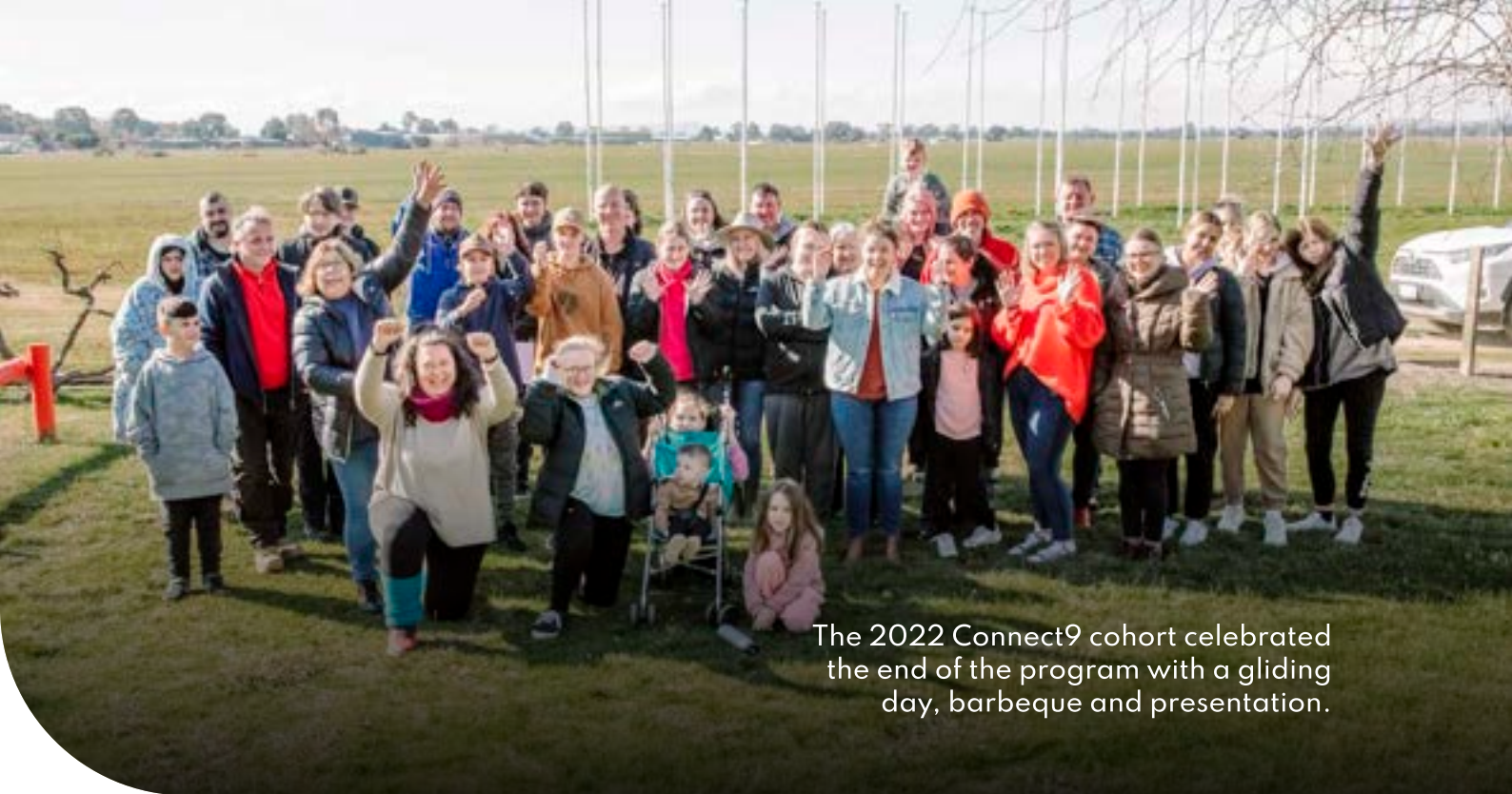
The 2022 Connect9 cohort celebrated the end of the program with a gliding day, barbeque and presentation.