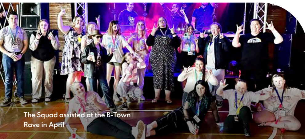
The Squad assisted at the B-Town Rave in April