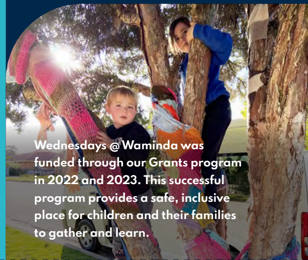
Wednesdays @ Waminda was funded through our Grants program in 2022 and 2023. This successful program provides a safe, inclusive place for children and their families to gather and learn.