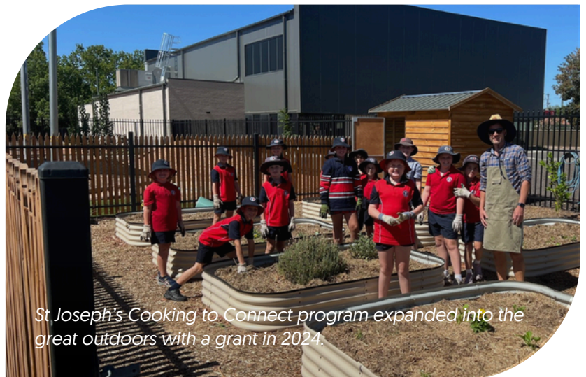
St Joseph's Cooking to Connect program expanded into the great outdoors with a grant in 2024.

Ongoing grant funding is possible thanks to individuals who generously give to our Community Fund.